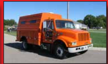
1999 IHC 4700

UNKNOWN MFG S/A 8X26 FIELD OFFICE TRAILER , S/N 97-162, c/w Lights, Electric Heat, (2) A/C, Plan Tables, Side Entry, Telephone Box, Spring Suspension