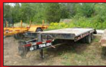
1 of 2 Trailing TK18-2400