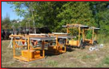
(4) 2010 ArrowMaster V Solar