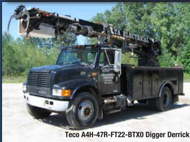
Teco A4H-47R-FT22-BTX0 Digger Derrick