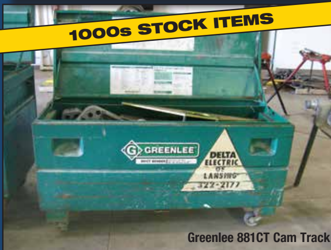
Greenlee 881CT Cam Track