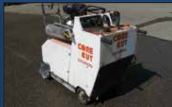
Diamond Core CC3500J