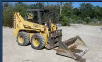
2001 Gehl SL5635 II