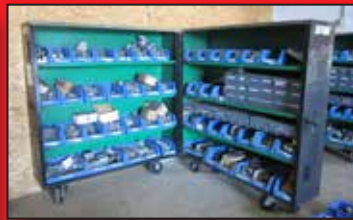
1 of 7 Parts Cabinets