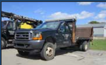
2001 Ford F550 XL