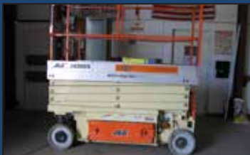
2006 JLG 2630ES (227 Hrs)

AUCTIONEERS WILL NOT BE RESPONSIBLE FOR ITEMS REMOVED FROM THE SALE BY FORCES OR FACTORS BEYOND THEIR CONTROL.