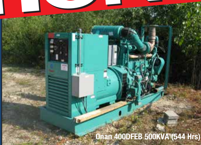
Onan 400DFEB 500KVA (544 Hrs)

This auction will feature live online bidding through PROXIBID. All Internet buyers are required to register 48 hours prior to the auction at the Proxibid Website ( www.proxibid.com ). All live internet bidders will be charged a 12% buyers fee for this service. Internet bidders will be required to comply to all terms and conditions for this auction as outlined in the buyers catalog.