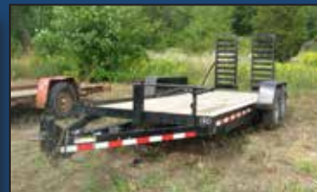
2002 BNM 18'