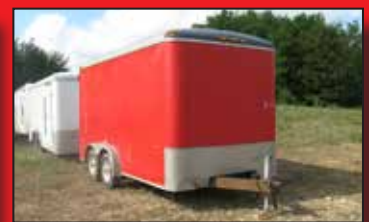
1 of 3 Cargo Trailers