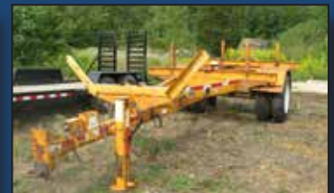
2005 Butler BPHD-1500