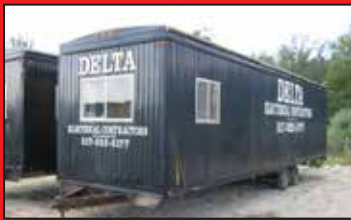
1 of 6 Field Office Trailers