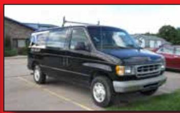
1 of 2 Cargo Vans