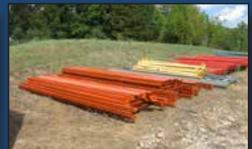
H.D. Industrial Shelving