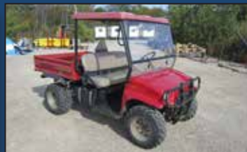
2007 Landpride 4410ST