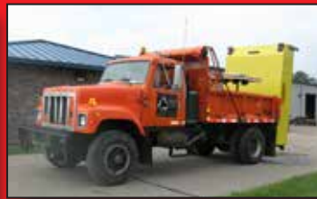
1996 IHC 2554