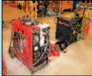
Snap-On MM250SL MIG & Bluepoint MA230 Plasma Cutter