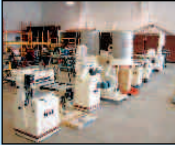
Jet Woodworking Equipment