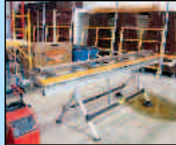
Tapco Pro 2000