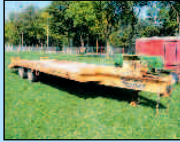
2002 Custom 20 Ton