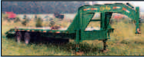
2003 Loadtrail (6 Ton)