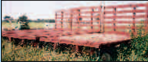
(4) Assembled Hay Wagons