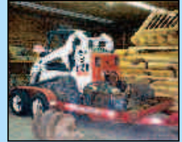
2001 Bobcat T190 Hy-Trac