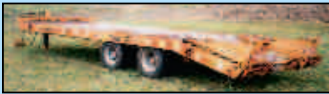
2002 Custom 20T252ADLP (20 Ton)

METABO SBE750 1/2" HAMMER DRILL WITH CASE DEWALT DC988 CORDLESS 1/2" HAMMER DRILL WITH CASE