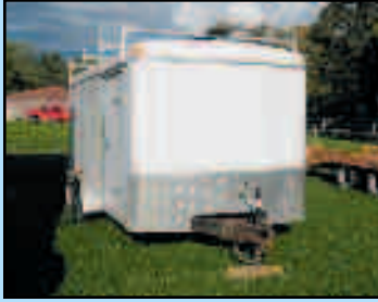
2001 Southwest 14 x 7