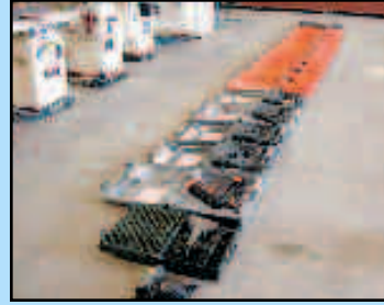
Cordless Framing Nailers