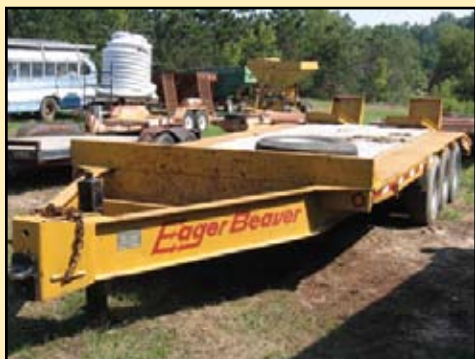
Eager Beaver 10 Ton