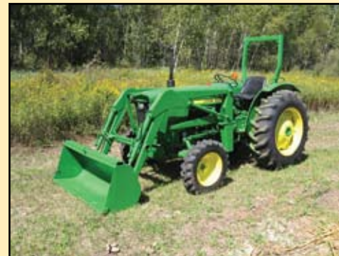
John Deere 1050 4x4