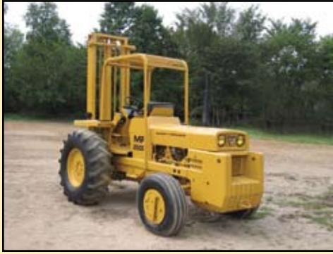
Massey Ferguson 2500