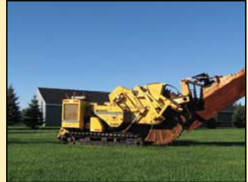
(1 of 3) Vermeer T600 CRC31 Rocksaus