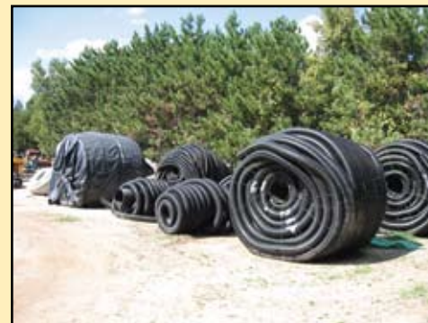
ADS Maxi Rolls