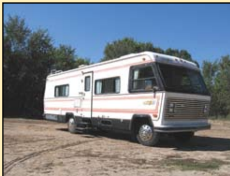
Alumalite 32 Ft.