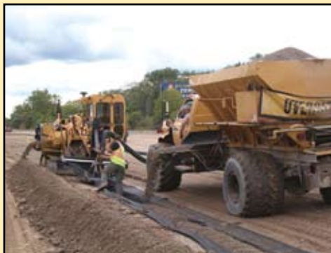
Vermeer T555TR & Spreader Truck at Work