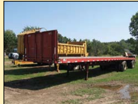
Great Dane 45 ft.